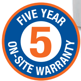
HL-6400DW Black & White Laser Printer